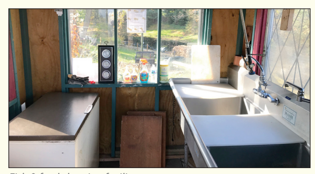
Fish & fowl cleaning facility