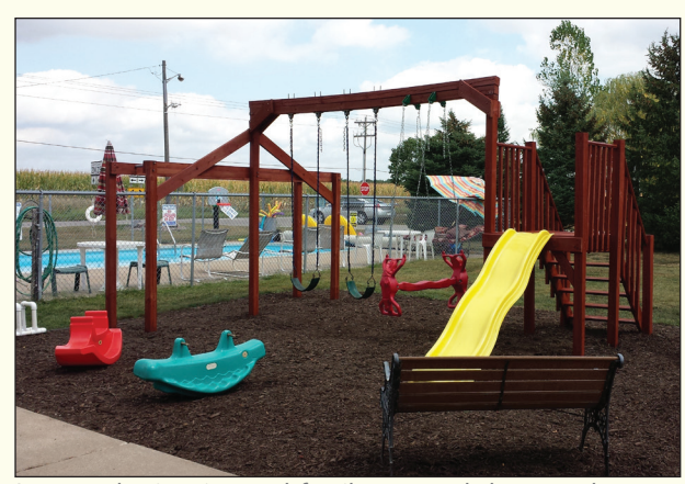
In-ground swimming pool, family area, and playground

Other amenities include an on-site playground, and fire pits with available firewood.