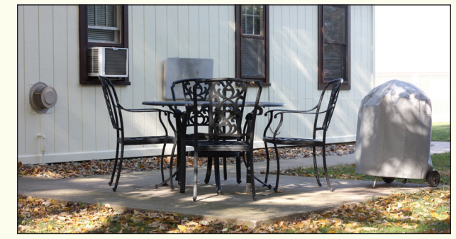
Each Cozy Cabin Cottage has a patio, BBQ, and fire pit