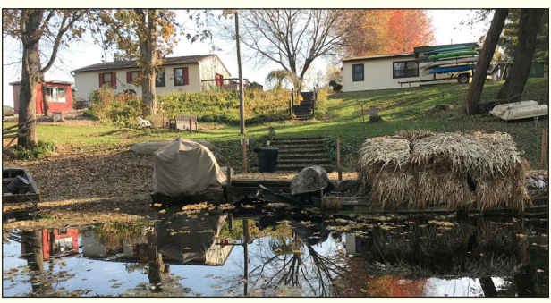
Private dock and direct water access